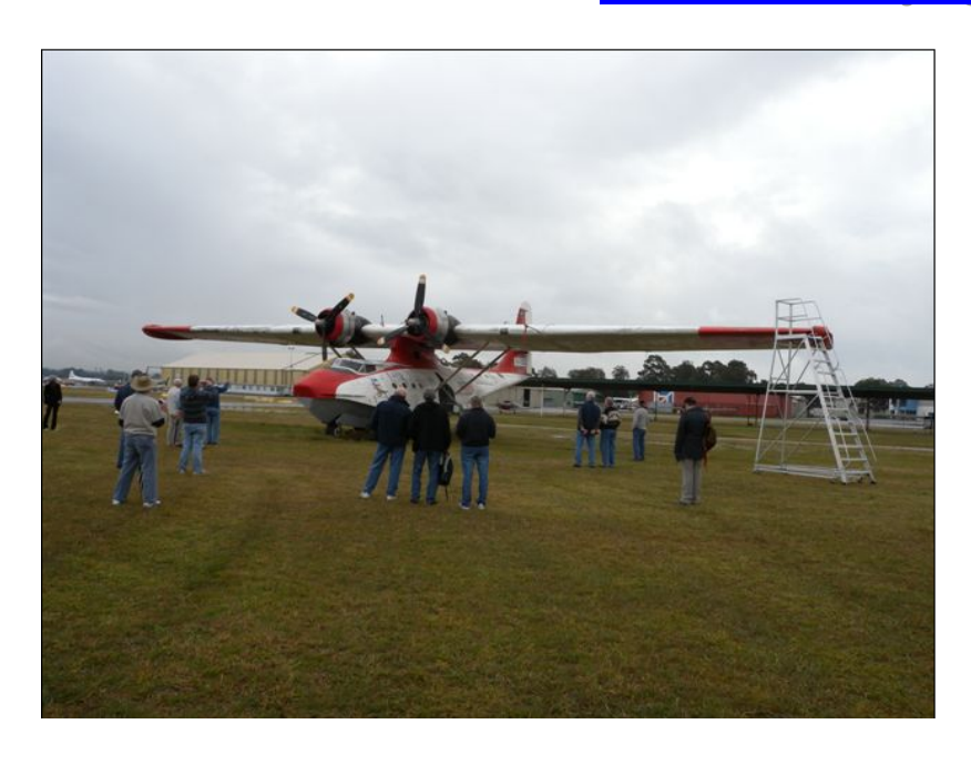
The engine run-up - 20 June 2009