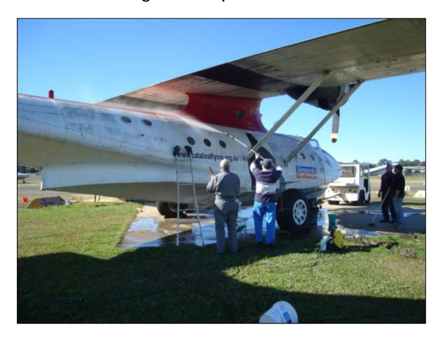
VH-CAT gets a good scrub – 4 July 2009