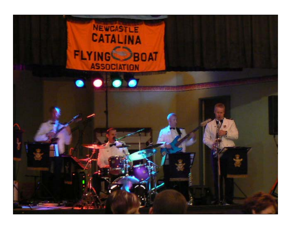
RAAF Swing Band in full flight (or is it swing?)