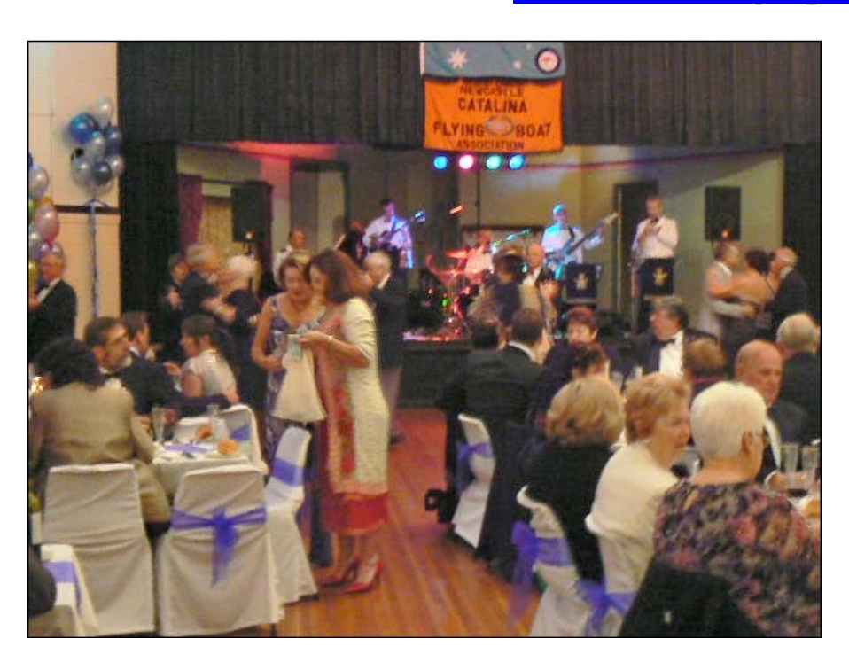
It's all go!!!