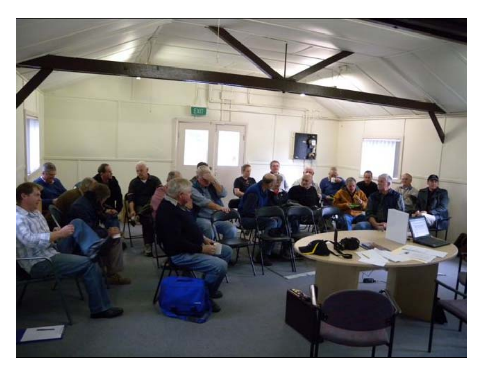
The Volunteers Meeting – 20 June 2009