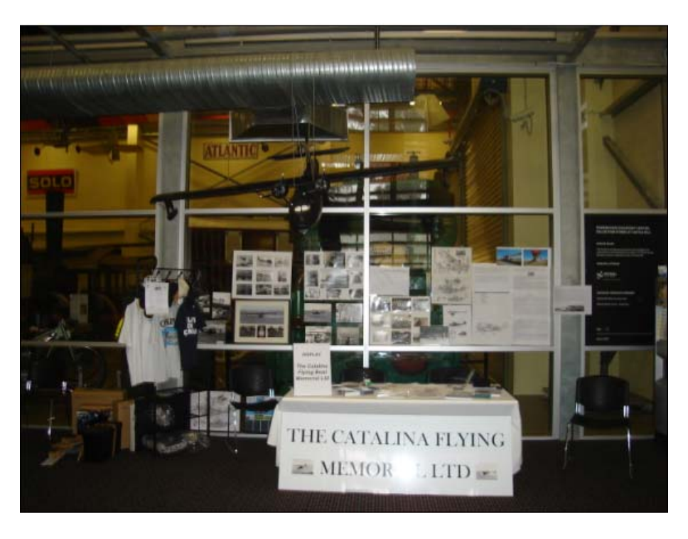
Our Display (note how the Cat's eyes reflect the flash!)